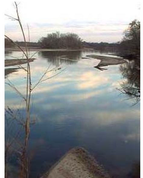
Along the Cedar River