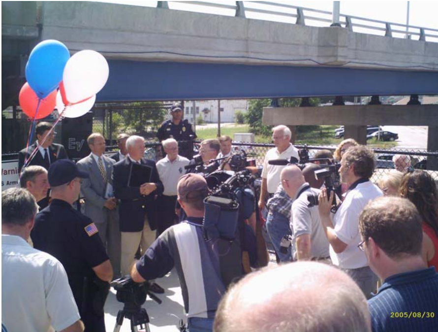
The press was out in full force for the ADT bridge ribbon-cutting. Officials present included directors of Illinois' departments of transportation and natural resources.