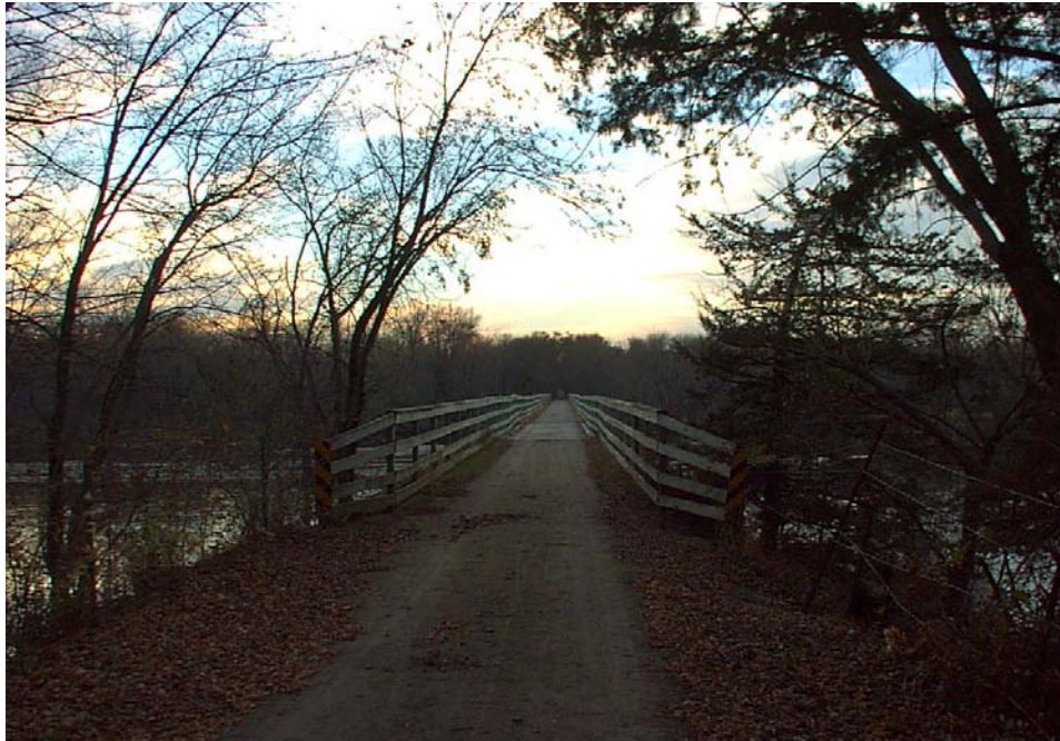
Bridge over the Cedar River on the Cedar Valley Nature Trail